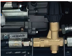
Cold Water Valve