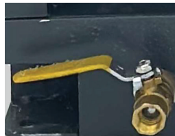
Water Tank Drain Valve